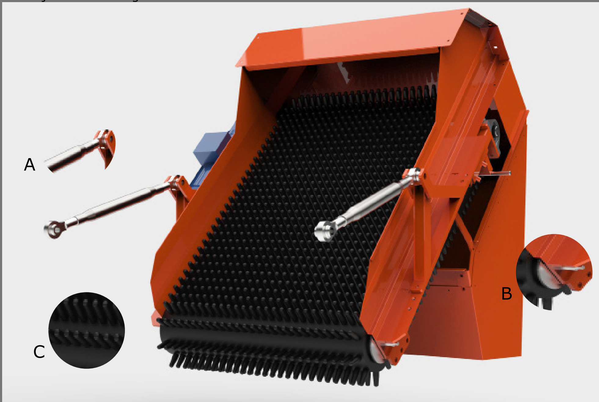
C The hedgehog-belt